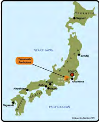
Rain shadow in Kofu Basin