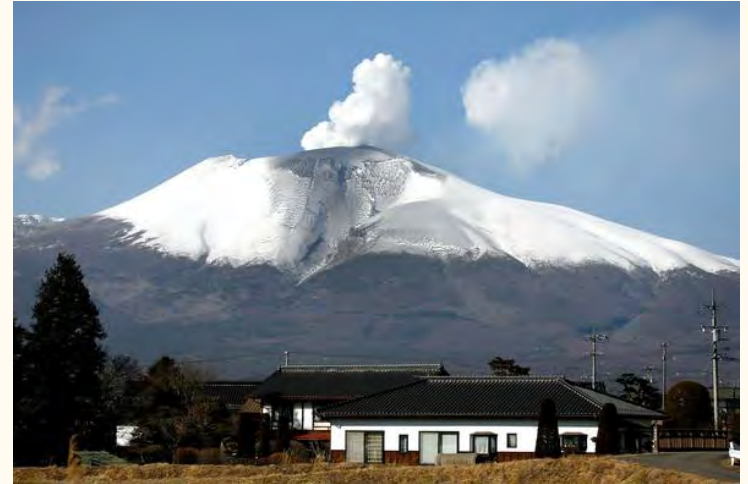
Mt Asama 2009 volcanic eruption

http://www.zimbio.com/pictures/4oNQpWx0EIS/Mt+Asama+Erupts