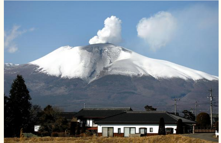
Mt Asama 2009 volcanic eruption